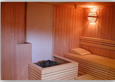
Wellness & spa areas; hotels and public places as well as private area