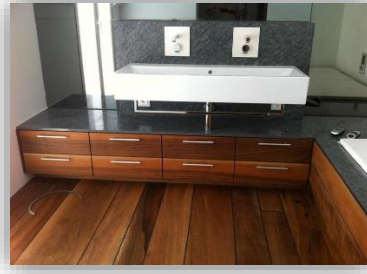
Bathroom; fully equipped and integrated furniture