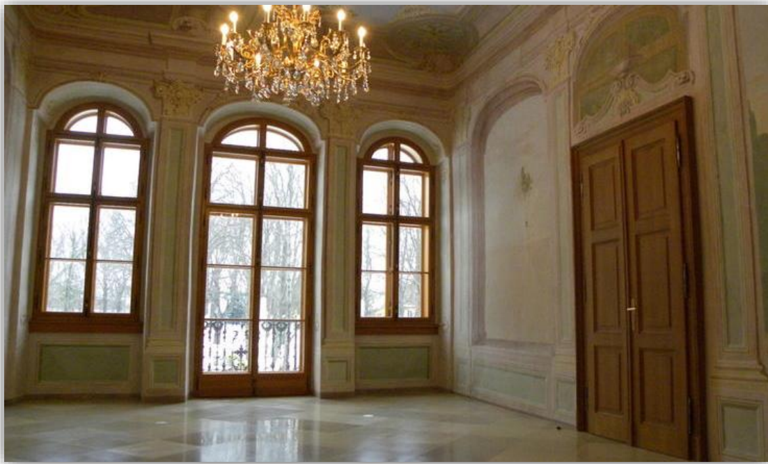
Fully renovated rooms of Viennese Palace (windows, doors and portals)

A substantial part of the services is dedicated to tailor made kitchen, bathrooms including sauna and wellness areas.